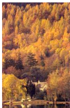
Kenmore, Loch Tay