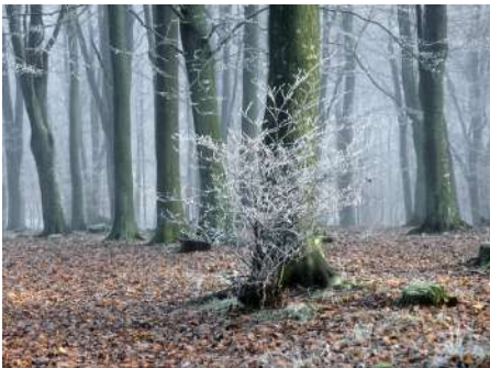
Winter in the Woods (HC)