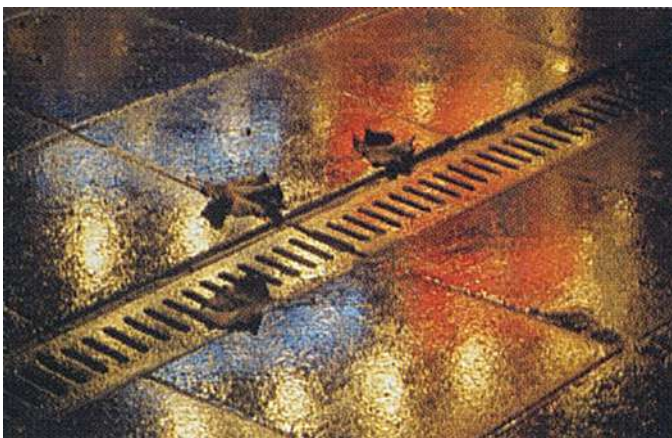
Street Reflections (FIAP Ribbon)