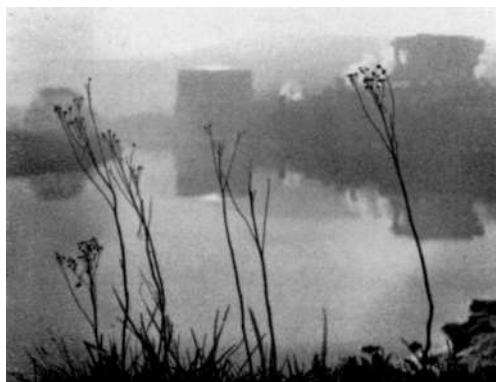
May 1959—Industrial Weeds

2001 C36 Winter in the Woods - Bill Armstrong FRPS