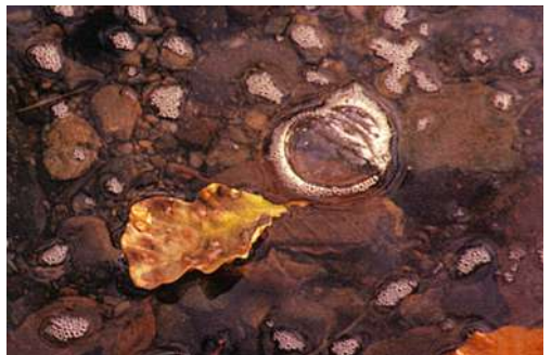
Autumn Reflections (HC)