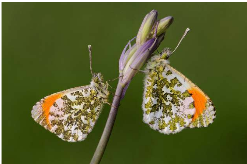
Orange Tip Butterflies , Neil Humphries, C32 Projected Image

LEIGHTON HERDSON PROJECTED IMAGE TROPHY & PLAQUE GLENN VASE NATURAL HISTORY TROPHY & PLAQUE—JOINT WINNERS